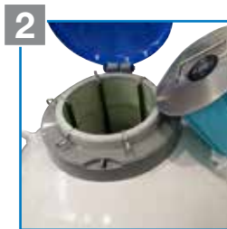
2 Insert stainless steel temp probe in Dewar