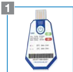
Set data logger