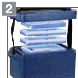
Pack inside box with sample and cooling blocks