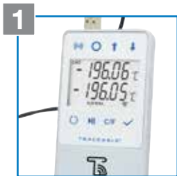
1 Create TraceableLIVE account and connect data logger