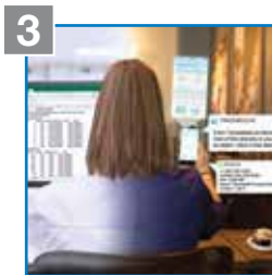
3 Receive instant alerts for temperature excursions. Monitor data/create reports on PC or mobile app