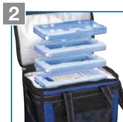
Pack inside bag with sample and cooling blocks